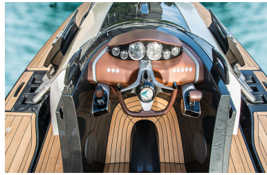
KORMARAN cockpit merging super sports car design with aircraft private jet design and marine requirements