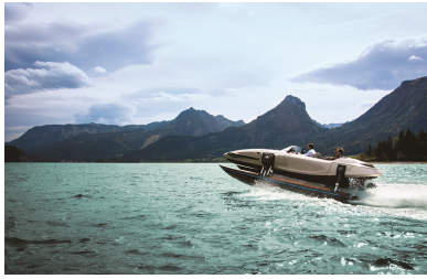
K7 at Lake Wolfgang near Salzburg (Austria)

Please let us know which photo you need. We will send it to you in print resolution.